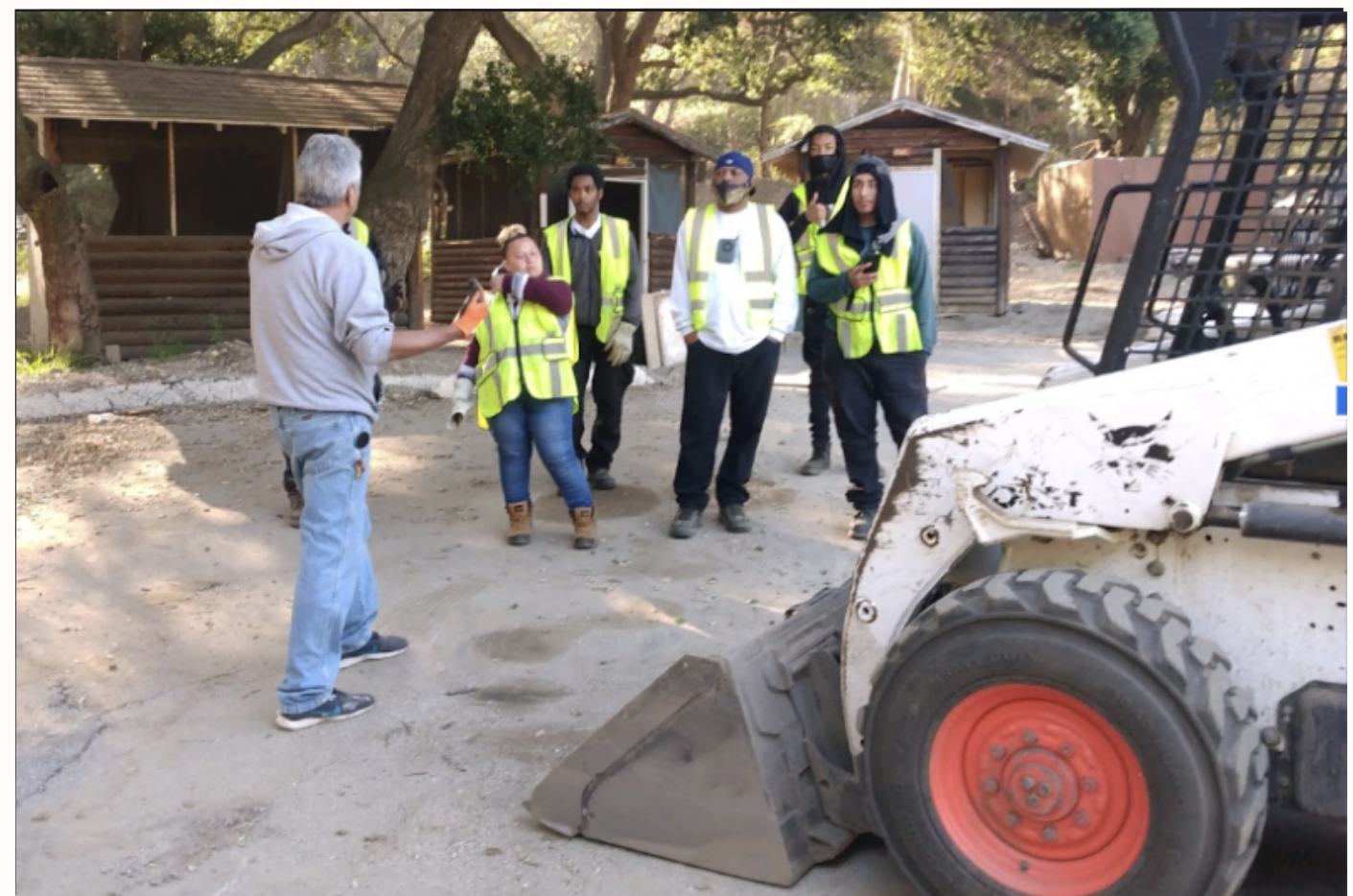
Crew listens intently during the safety orientation