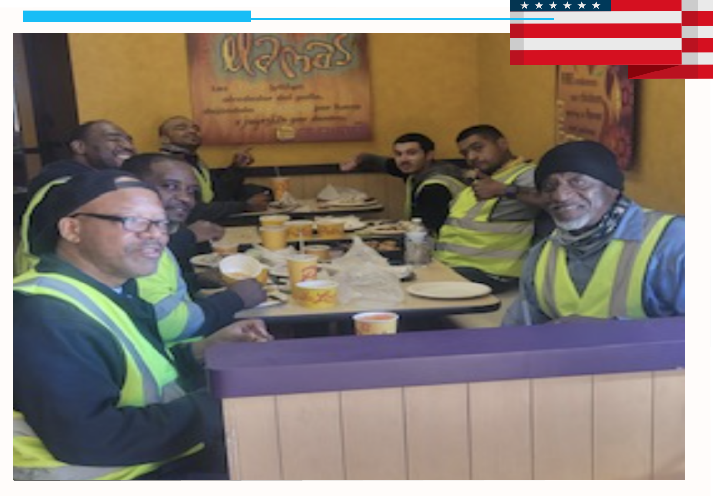
Some of our Los Angeles Veterans being appreciated at lunch

Five Keys took the opportunity to thank and acknowledge our veterans on the transitional employment crews this Veterans Day. Teams received lunch/gift cards in appreciation. Thank you for your service!